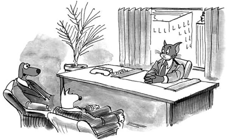
"We welcome you as the first product of our Diversity Program. Now let's go get some dog chow."