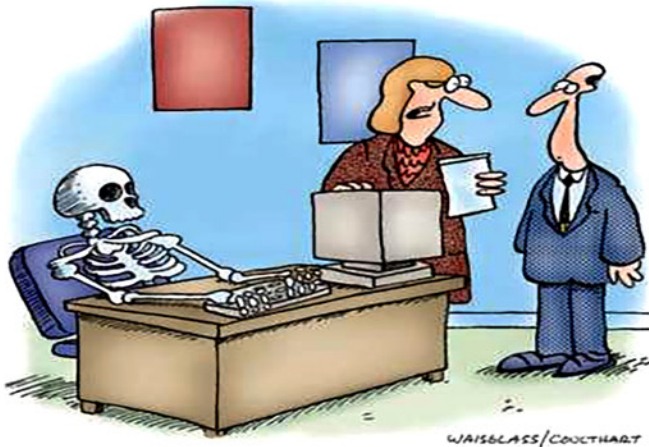
"It's worse than we thought—everyone's been covering for him."