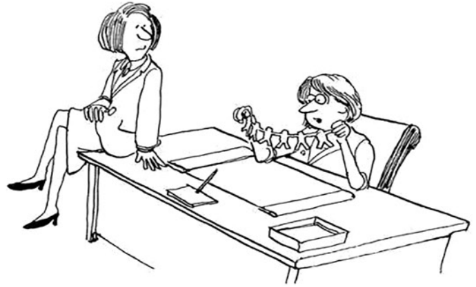
"On paper we have the perfect team."