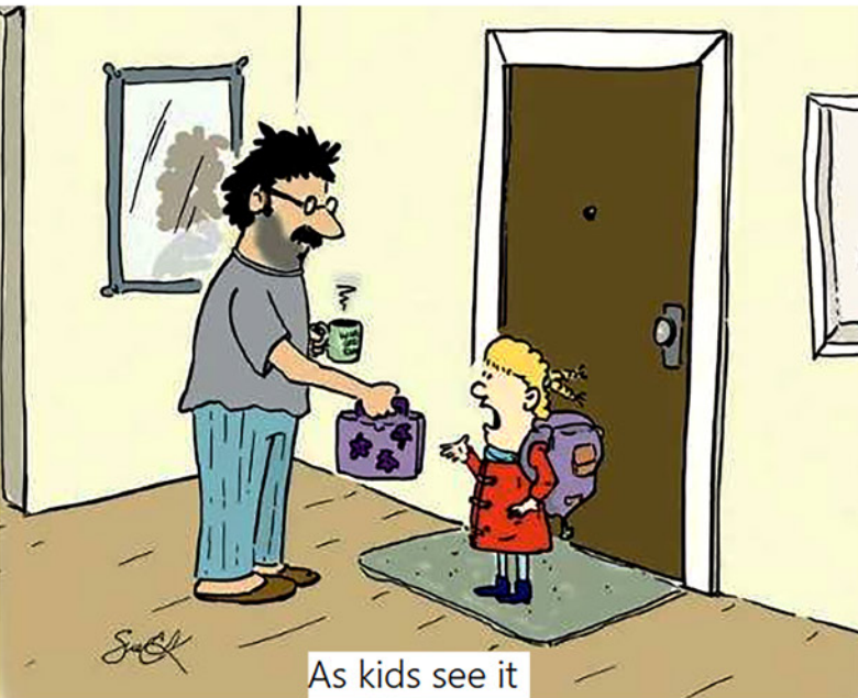
"If you get to be a stay-at-home dad, why can't I be a stay-at-home kid?"